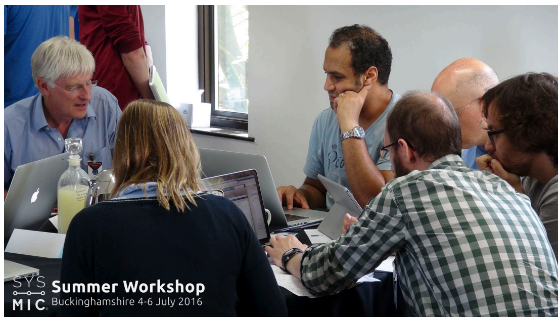
Participants of a SysMIC intensive workshop