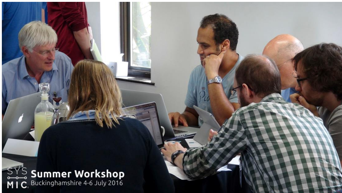
Participants of a SysMIC intensive workshop